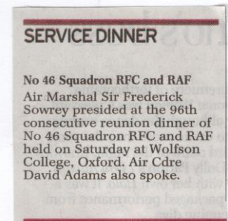
Daily Telegraph. Monday 3 June 213